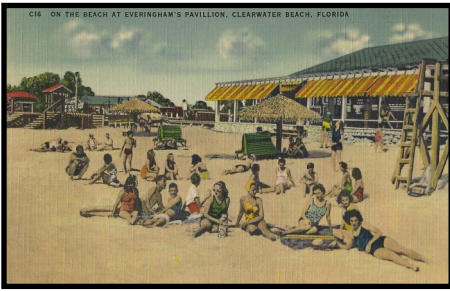
Sun worshippers at Everingham's Pavilion on Clearwater Beach