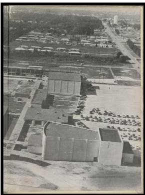
Clearwater High School being built just east of the Central Pinellas Stadium, later to become Jack F. White Stadium.