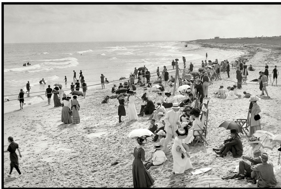
Beach Days Are Here Again: This is how families used to dress for a day at the seashore on Clearwater Beach in 1910.