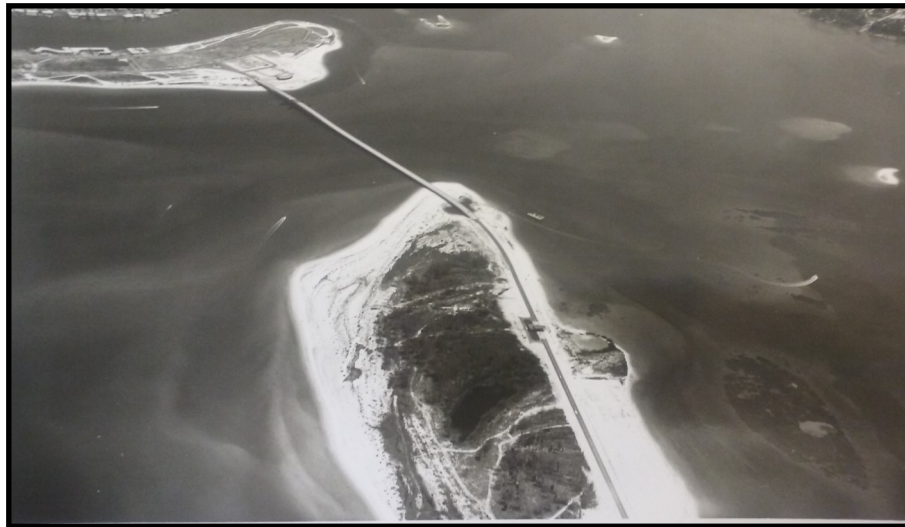
LEFT: An aerial photograph of Sand Key in 1960. It shows the bridge north from Sand Key to Clearwater Beach. Notice how small the north-eastern tip of Clearwater Beach looked back then. Our Florida Gulf Coast barrier islands have minds of their own regarding addition and erosion of sand.